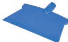
K48283 FLOOR SCRAPER 1 ROUND CORNER 1 SQUARE CORNER 11 X 1.5 X 7" PBT .30