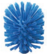
K47153 TUBE CLEANING BRUSH - 4.75" MEDIUM