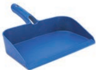
K80302 DUSTPAN FOR BENCH BRUSH 12 X 12.5" POLYPROPYLENE