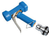
K0411 WATER GUN HEAVY DUTY BRASS K5372 CONNECTOR