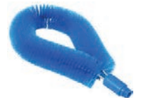
K47260 PIPE CLEANING BRUSH - 4"