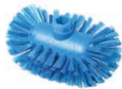
K15026 TANK BRUSH - 8" STIFF POLYESTER PBT .50