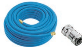
K922 WATER HOSE 100' MALE FITTINGS K0703US CONNECTOR