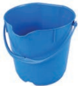
K80101 BUCKET 4 GAL POLYPROPYLENE K80112 LID FOR BUCKET